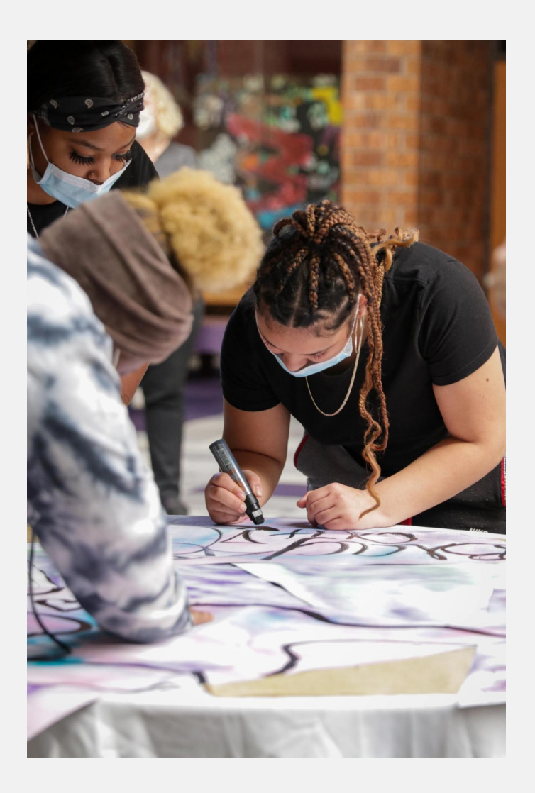
NFTA 2021 Highlights