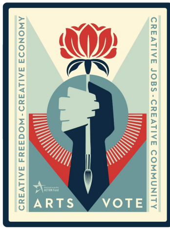
ArtsVote artwork by Shepard Fairey